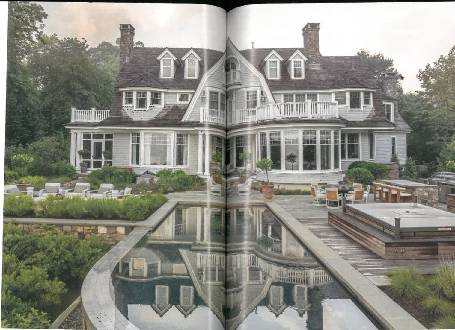
ABOVE: The ipe wood deck blends the hot tub into the entertaining area while allowing it to make its own quiet statement.

Working within the lawn's grade, Mike saw an opportunity to integrate the entertaining area and enhance the integrity of the site. The plantings alongside the back