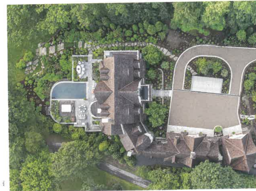
ABOVE: Terrapin Landscapes created a heated driveway finished with pea stone spread over liquid asphalt. Mike says the homeowner loves how driving in sounds like riding over soft gravel. LEFT: Every Terrapin Landscapes project contemplates how built features can fortify the surroundings.